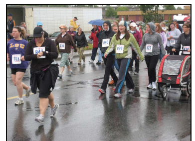
2011 Run for Women

Volunteers are Welcome! For more information or to volunteer your assistance on race day or prior to the race contact the Volunteer Coordinator at 283-9479.