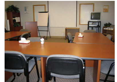
LeeShore's community meeting room

To learn more join us for our bi-annual Community Awareness Workshop to be held April 18 - 22 . Learn about Domestic Violence and how it effects children, Cycle of Violence, Sexual Assault, Victim Services and much more. This 45 hour class will be held at The LeeShore Center. The $35 class fee includes all workshop materials and snacks. A break will be provided daily for lunch off-site.